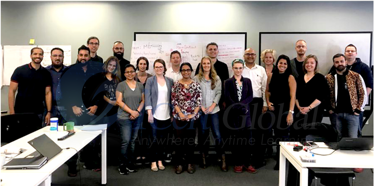
2-Day PMP Fundamentals Training Mississauga, ON, Canada - May 9-10, 2019